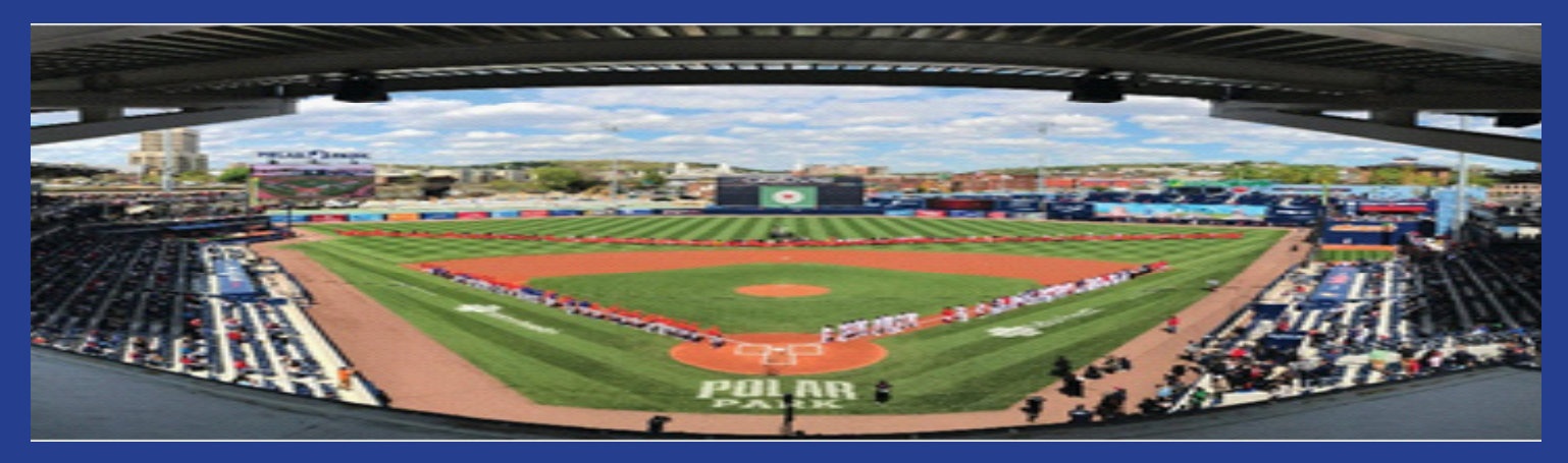
October 17, 2023 | Polar Park, Worcester, MA